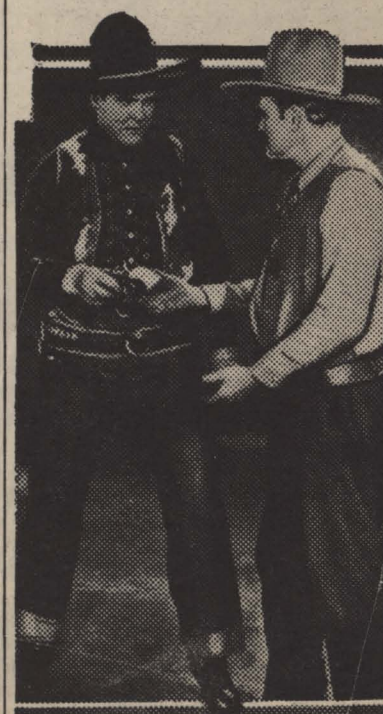
1 Col. Scene Cut or Mat No. T-334