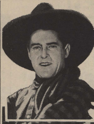
1 Col. Star Cut or Mat No. T-335