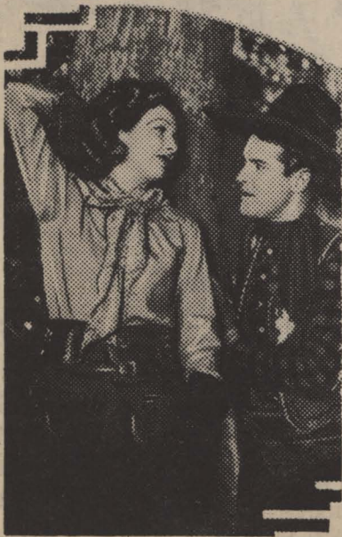
1 Col. Scene Cut or Mat No. T-333

The entirely different form of exercise required to keep in shape for swimming, from that required for dancing prohibits her from doing all of the swimming she would like to do for at one time she, herself, was an endurance swimmer and high-diving champion, and she has won many cups and awards for her prowess.