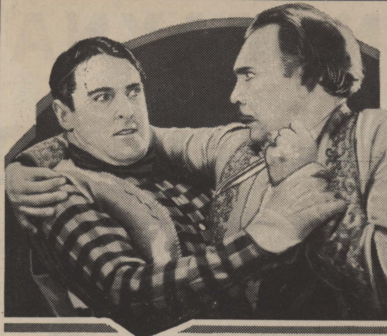
2 Col. Scene Cut or Mat No. T-332