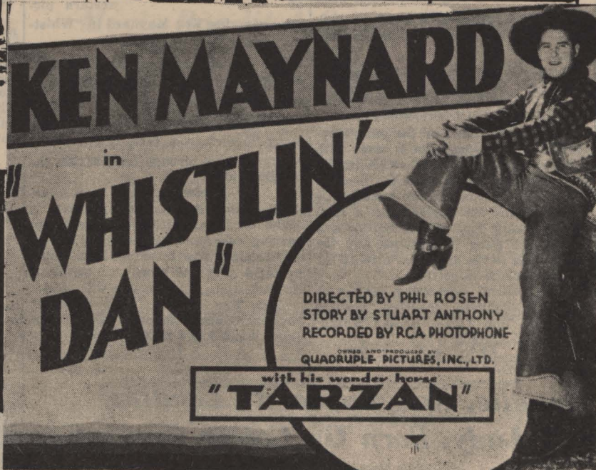
2 Col. Ad Cut or Mat No. T-337