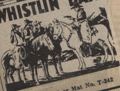
1 Col. Ad Cut or Mat No. T-342