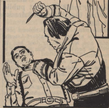
1 Col. Ad Cut or Mat No. T-341

The dashing, daring Ken Maynard in a swift-paced all-action story of the rugged West that was.