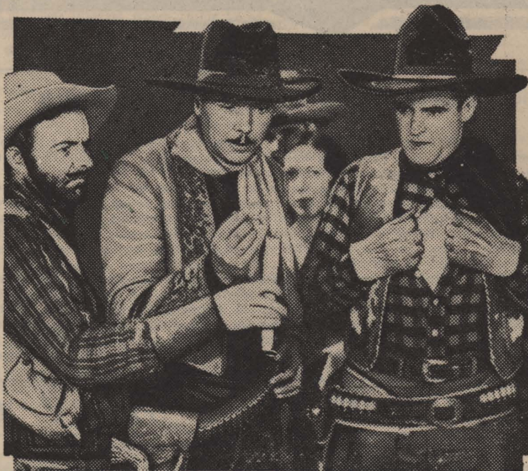
2 Col. Scene Cut or Mat No. T-330